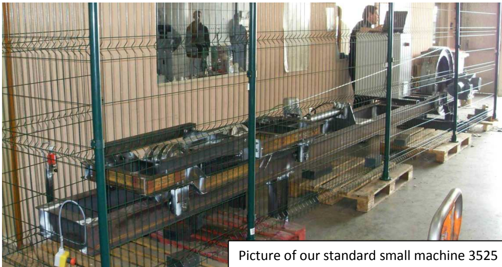
Picture of our standard small machine 3525